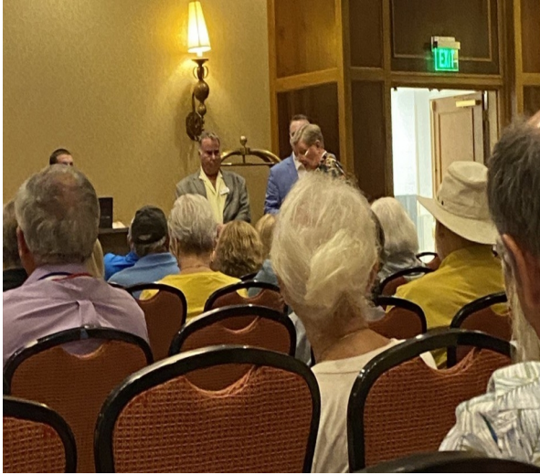
TCCR Staff Photo