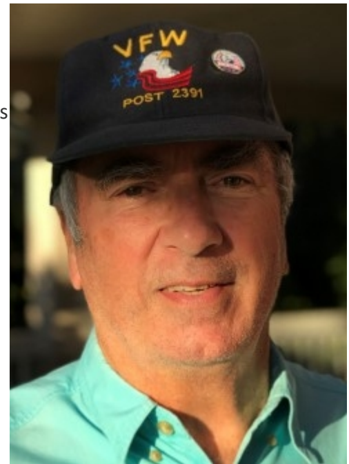
TCCR Staff Photo

Today I thought I would look into what all the fuss was over guns and who was behind it. The information on Mayors of cities comes from doing a general search of the mayors of the cities listed at the website below, which contains the top 65 cities in the US. regarding murder rates per capita: Of course, Communist Democrats always point at these statistics using the words, "GUN VIOLENCE!" And the answer is, "none", to the question of how much murder is associated with, "HAMMER, ICE PICK, BRICK, KNIFE, CAR, TRUCK, BASEBALL BAT, BEATING TO DEATH, POISON, HANGING ROPE, PUSHING OVER A CLIFF, STRANGULATION, etc., violence". The reason is that the New World Order is not afraid that the citizenry is going to "baseball bat violence" or "hammer violence" (oddly one of the favorite weapons of outlaw bikers) them to death, especially when they control all the guns.